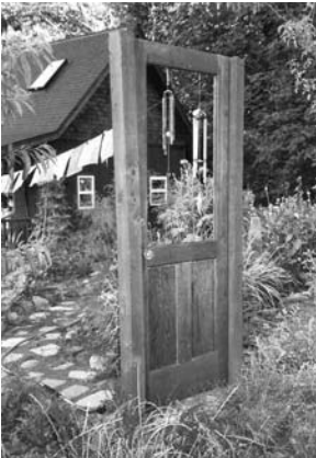
Stairways and Doors: Wandler Hotel, Vienna; Ritual door, Suquamish, Washington.